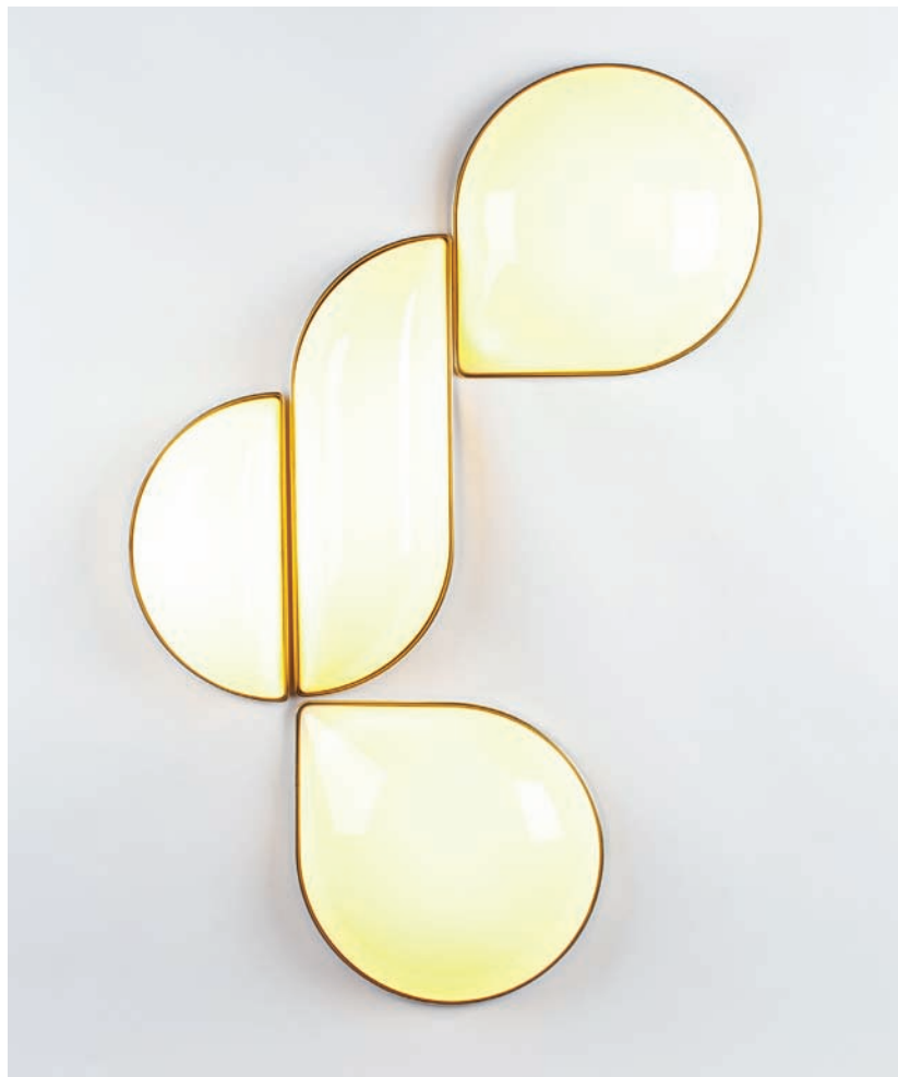
Odds & Ends custom installation