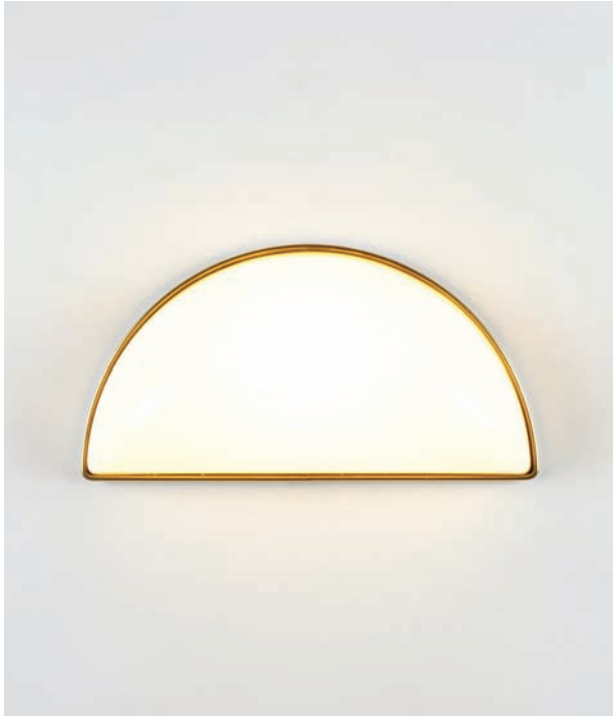
Odds & Ends - Rainbow