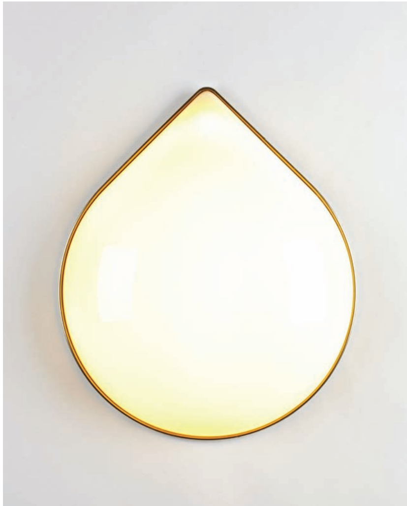
Odds & Ends - Teardrop

Odds & Ends is a series of wall lights designed in three basic shapes: Teardrop, Rainbow and Aquafresh—so named because it resembles a dab of toothpaste. The series, which is illuminated by LEDs, can be installed in multiples to create large installations of varying designs.