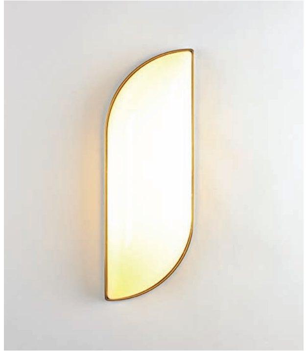
Odds & Ends - Aquafresh